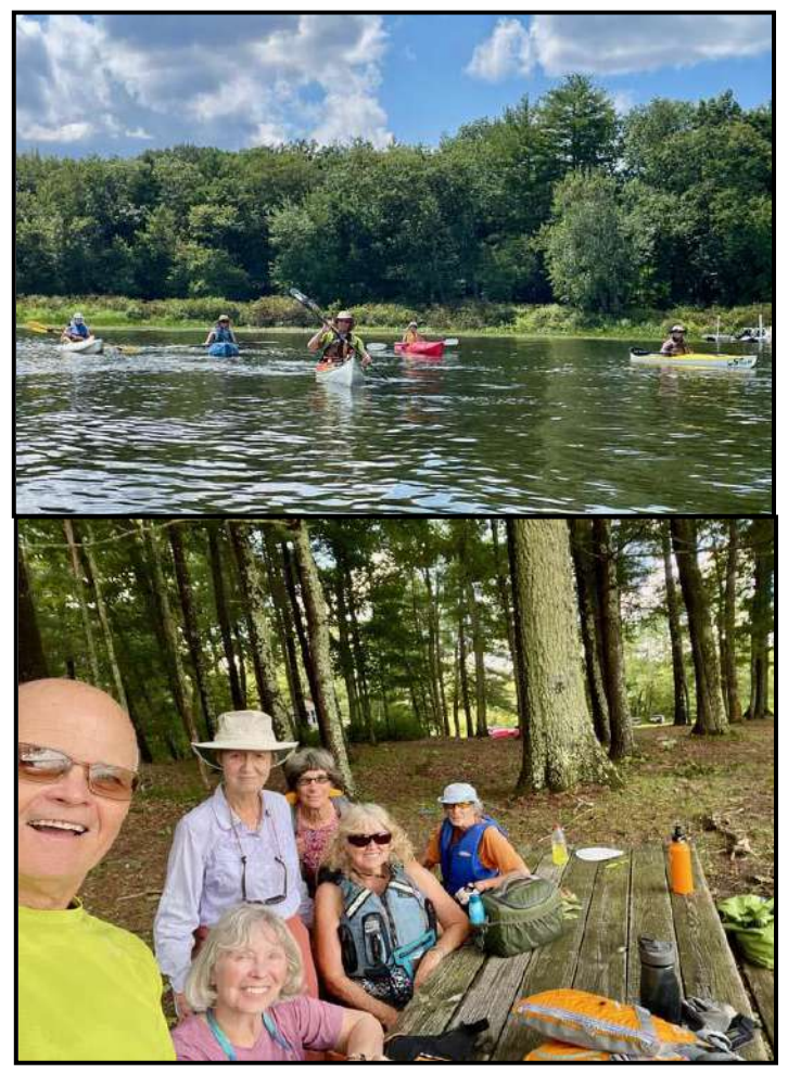
A fun day on the river!