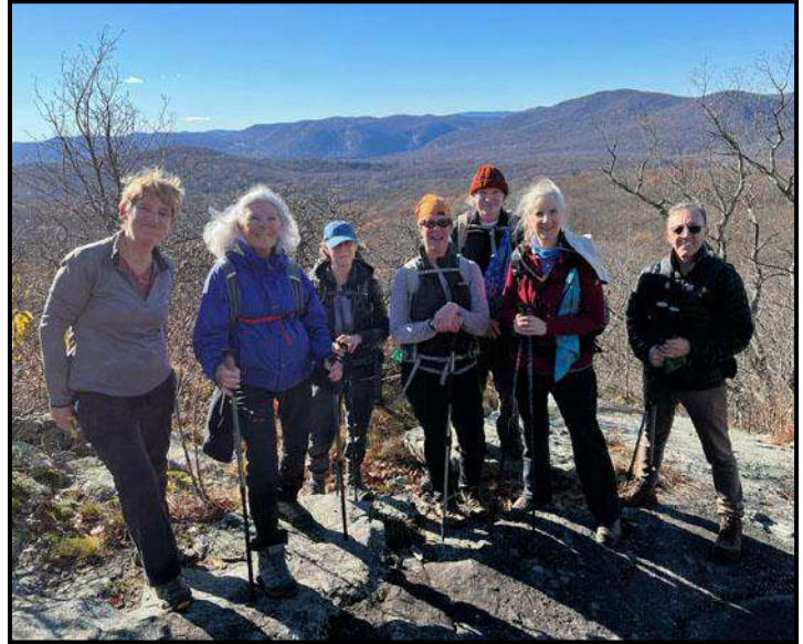
Hikers enjoying the view from the summit on the East Mountain Round Hill Loop

This hike was planned as a Round Hill East Mountain loop. But it became an East Mountain Round Hill loop. "New bridge under construction" meant old bridge (two metal beams) was removed, and there was no new bridge yet. So heeding wise advice from Janice Miller, we decided to risk wet feet closer to our cars. Hence the reverse move. The weather was great, whichever way one went. And the leafless trees allowed views from numerous vantage points. The speedy hikers covered the ground quickly, but we had time to study the mullein (fuzzy plant) on the upper reaches of the Fahnestock trail. Great day! Submitted by Jane Restani