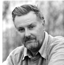
On the trail, circa 1970